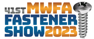
Table Top Show

The Mid-West Fastener Association is hosting our 41st Fastener Show on August 22nd, 2023, in our popular Table Top format. Fastener suppliers are invited to showcase their products and other services at this one-day show.